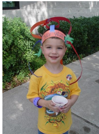
Optical Illusion: 3-D Art