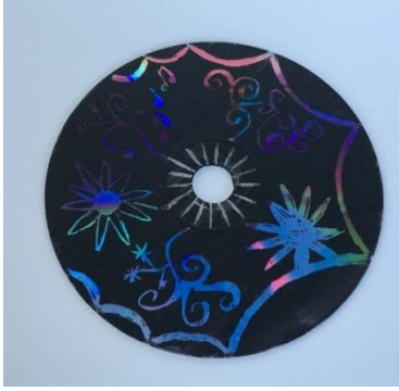
Etched CD (E, T)