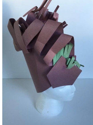
Silly Hat (T, P, E, A)